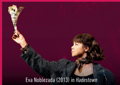
Eva Noblezada (2013) in Hadestown